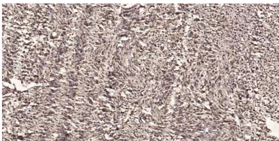
Immunohistochemical analysis of paraffin-embedded human small intestinal carcinoma tissue. 1,primary Antibody was diluted at 1:200(4° overnight). 2, Sodium citrate pH 6.0 was used for antigen retrieval(>98° C,20min). 3,Secondary antibody was diluted at 1:200